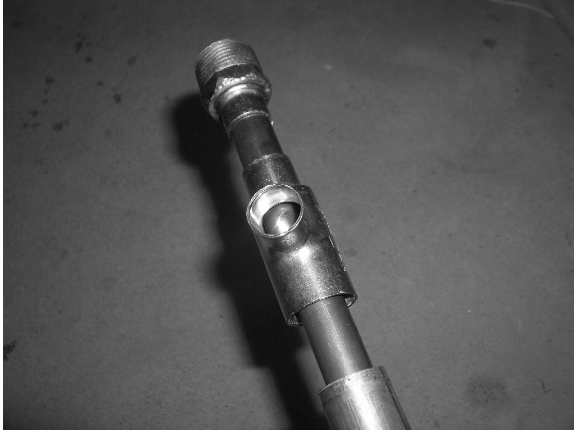
Photo #4. Top end of coaxial drier showing water jacket connection in exploded view.